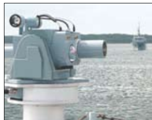
Stabilized laser communication from Carl Zeiss: tests on laser communications up to 24 km between the German multipurpose naval boat Breitgrund and a land station were successful.

On the basis of ethernet, laser communication allows transmission of digital data in real time, also encrypted in accordance with IPv4 and IPv6. Aerial photos, images from covert reconnaissance, radar and sensor data can be transmitted over long distances to control centres and between mobile units without the risk of interference or interception. The high network capacity offers transmission rates in the