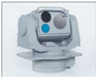
The MEOS II stabilized platform for 360° reconnaissance, object observation and the determination of target coordinates has been specially developed for surface ships.

Gbit range. It is also required to transmit and use uncompressed sensor information without a loss of data or time. This is necessary, for example, for the real-time evaluation of long-endurance missions with drones and UAVs.