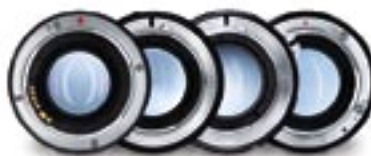
ZE ZF.2 ZF ZK