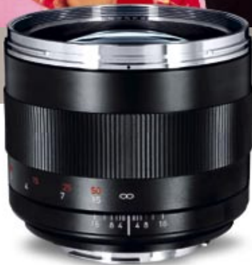
Picture shows ZE mount