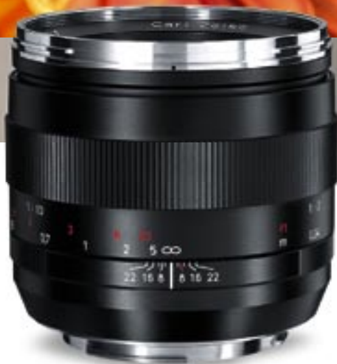
Picture shows ZE mount