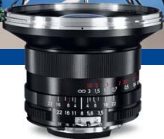
Picture shows ZF mount