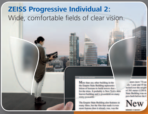
ZEISS Progressive Individual 2: Wide, comfortable fields of clear vision.

Illustrations are simplified examples. Effects are subject to individual experience and prescription.