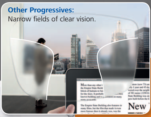
Other Progressives: Narrow fields of clear vision.

Illustrations are simplified examples. Effects are subject to individual experience and prescription.