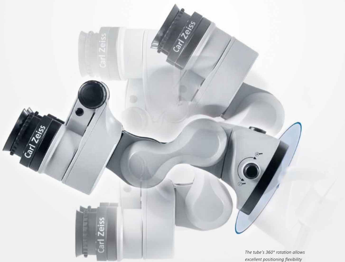
The tube's 360° rotation allows excellent positioning flexibility

The Foldable Tube f170/f260 combines brilliant apochromatic optics and a unique design for maximum visualization flexibility, magnification potential and positioning adaptability. It allows surgeons a wide range of comfortable working positions, even at extreme surgical approach angles.