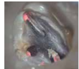
Identify hidden microfractures