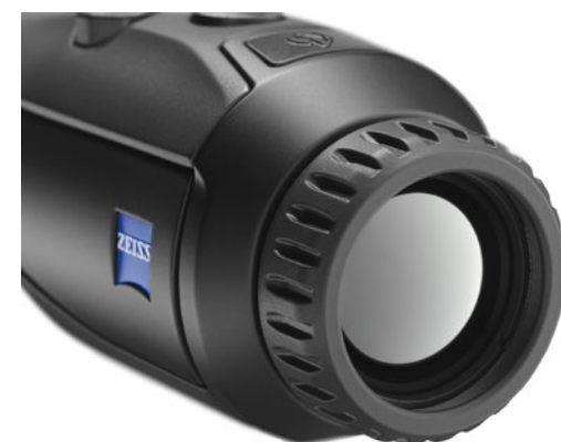
Objective Lens with Image Focusing Ring