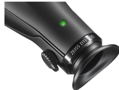
Oval Ocular Eyepiece with high-resolution HD LCOS display