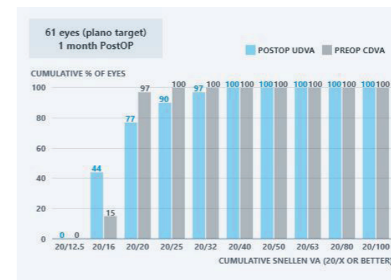
Figure 3. Scattergram showing first month post-op efficacy.

The most important factor for achieving success and patient satisfaction when performing laser vision correction surgery is to choose the right procedure for each patient. Because of its outcomes and benefits like flapless technique, Lenticule Extraction with SMILE is my treatment of choice for nearly all patients needing myopic correction with and without astigmatism.