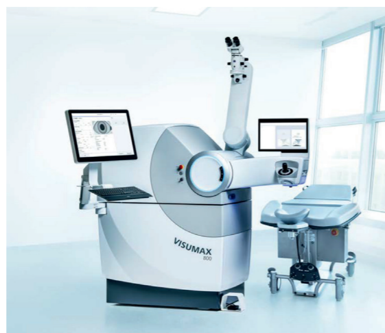
Figure 1. ZEISS VISUMAX 800

In addition, the VISUMAX 800 is physically a completely new device. As compared to the former VisuMax, the new laser has a smaller footprint and therefore needs less space in the operating room. The VISUMAX 800 is also mobile and can be relocated according to