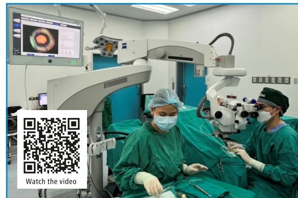
Figure 1. Performing cataract surgery in a fully digital environment using EQ Workplace to seamlessly connect the operating room with pre-operative and post-operative patient assessment and care.

Notably as well, I have seen a remarkable increase in my premium IOL case volume since I switched to the digital workflow. For reasons explained further below, I became more certain that I could consistently deliver excellent refractive outcomes. Therefore, I also became more comfortable offering premium IOLs to more patients. I also believe that my patients sensed my greater confidence and, on that basis, became more motivated and trusting to choose a premium procedure.