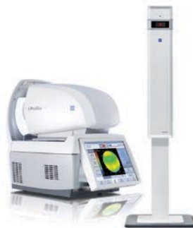
Available on all ZEISS lenses

Visit www.zeiss.com/equipment to learn more.