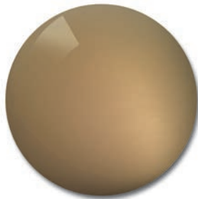
ZEISS DuraVision Mirror Bronze