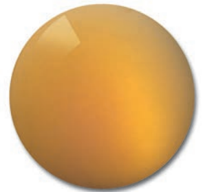
ZEISS DuraVision Mirror Gold