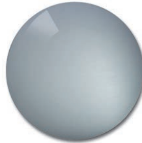
ZEISS DuraVision Mirror Silver