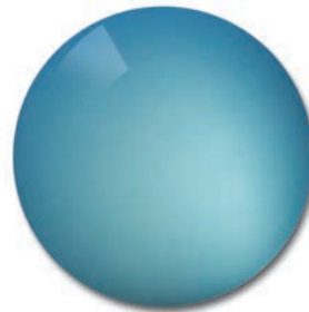
ZEISS DuraVision Mirror Blue