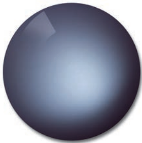
ZEISS DuraVision Mirror White

ZEISS URBAN Fashion mirrors offer a new look for Rx lens wearers.