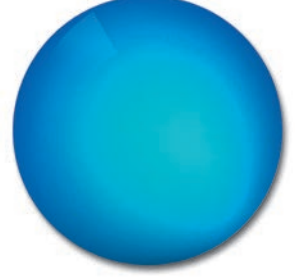
ZEISS DuraVision Mirror Strong Blue