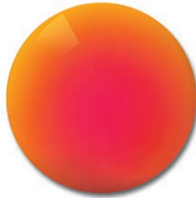
ZEISS DuraVision Mirror Red