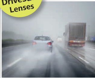
Feel SAFER while driving