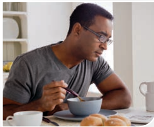
Outstanding all-day vision

ZEISS DriveSafe – the only pair you'll need to make driving feel safer and to provide excellent all-day vision.