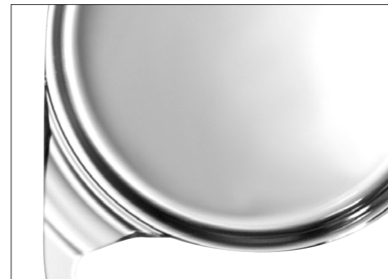
Figure 1. Schematic illustration of the CT LUCIA 621P optic-haptic junction

Unfolding of the CT LUCIA 621P IOL in the capsular bag is facilitated by its heparin-coated surface*. Yet, the lens unfolds in a gentle and controlled manner that enables its positioning. The sophisticated optic-haptic junction with its relatively rigid and enlarged step-vaulted haptics socket (Figure 1) together with the length and biomechanics of the haptics act to maintain stable IOL centration.