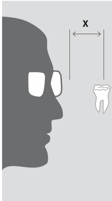
Determine work position, working distance and magnification need