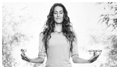
EnergizeMe Spectacle Lenses